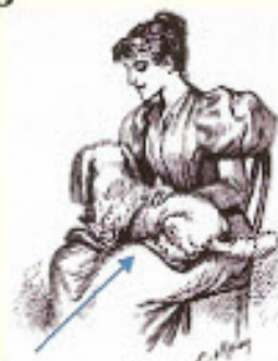
A Person's Lap