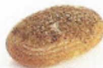
Loaf of Bread