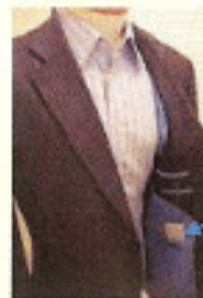
Inner Jacket Pocket