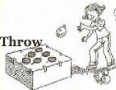
To Toss or Throw