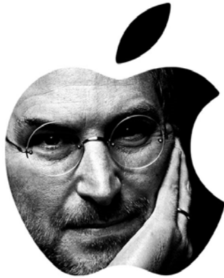
Steve Jobs 1955 - 2011