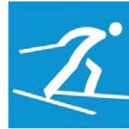
Cross Country Skiing