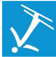
Freestyle Skiing Aerials