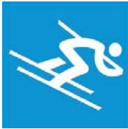
Alpine Skiing (Speed)