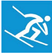
Alpine Skiing (Technical)