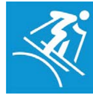
Freestyle Skiing Moguls