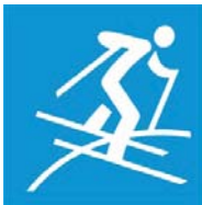
Freestyle Skiing Slopestyle