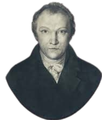
William Blake. 'The Tyger' (1794).