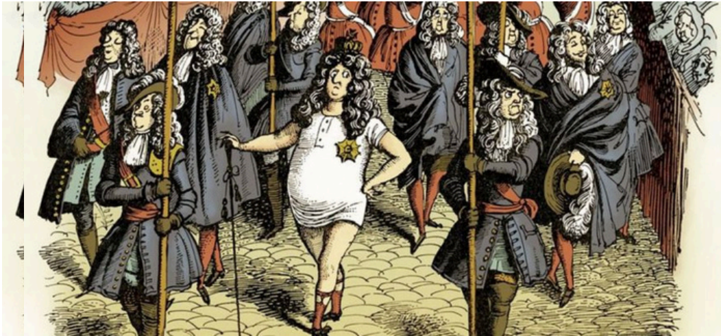
Original Text Version